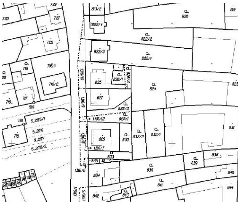
Fig. 2: A specimen of newer map 1:1000 – digital cadastral map.